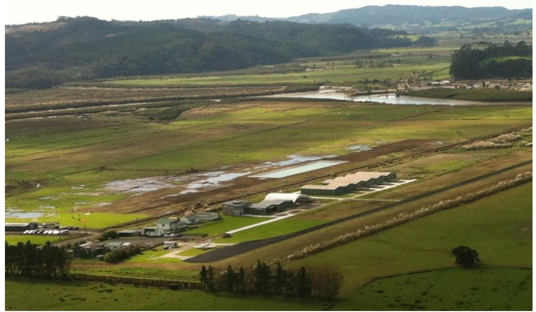
West Auckland Airport Parakai

Aimm has contacts with Flying Schools (and those wanting to start one) and have been able to assist small airports in obtaining a very valuable addition to their town.